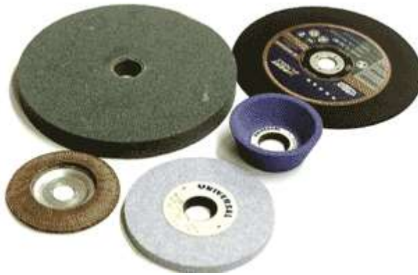
Some of the wheels that candidates inspect for signs of wear etc.

The course covers vitrified, resin bonded, flap wheels and diamond impregnated wheels. The dangers of overspeed is stressed throughout the training, and delegates practice reading rating plates, blotter codes and using optical speed measuring instruments. Delegates are shown examples of fixed and mounted abrasive wheels, along with the necessary information to determine the composition, grade, maximum peripheral speed and application. Practical exercises make up the majority of the day, with delegates selecting and identifying a range of wheels.