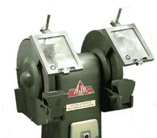
The pedestal grinder that candidates on the course inspect and make adjustments to

The instructor will ask delegates to examine a bench grinder and assess its suitability for use in the work place making a written report of their findings.