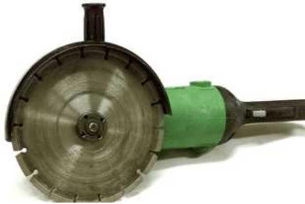
The hand grinder that candidates on the course inspect

The same exercise is carried out on hand portable machines, with checks being made on guards and other adjustments.