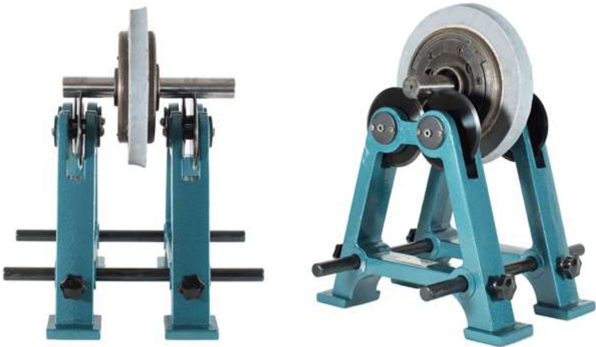
The wheel balancing rig used on the course

Abrasive wheels will be given ring tests to check their integrity and delegates are shown how to balance a wheel using a wheel balancing rig.