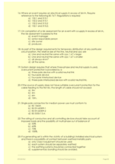
The multiple-choice assessment paper used on the BS7909 course

If you would like to learn more about the course on BS7909 - Temporary Electrical Installations then please call us.