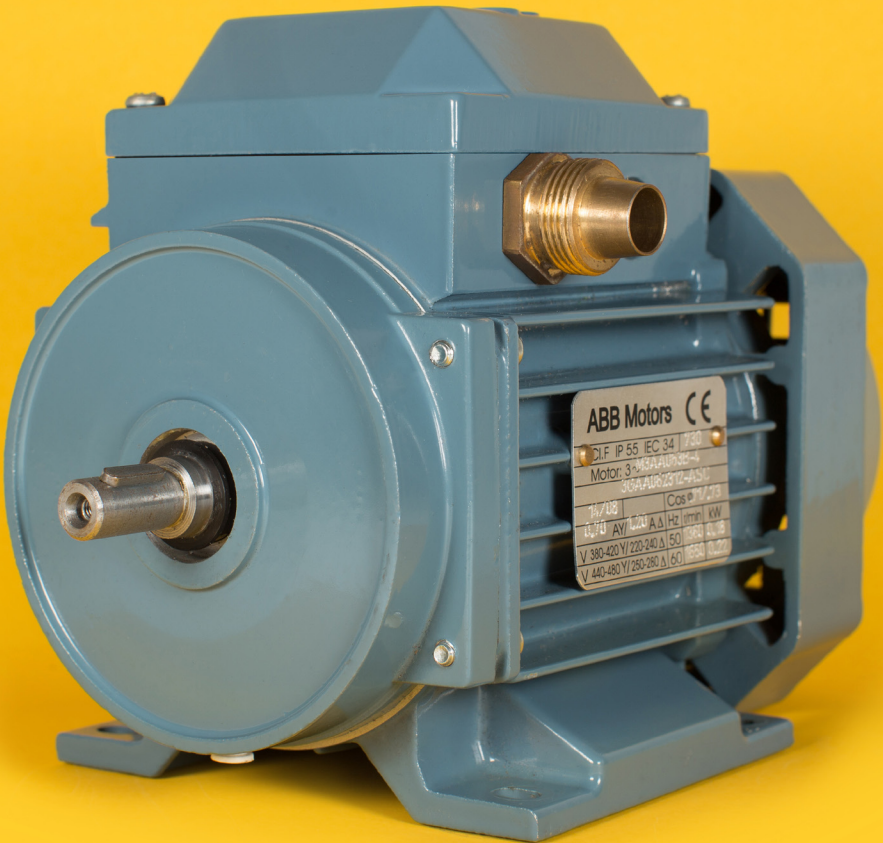
ABB Motors CE D.F. IP 55 IEC 34 750 Motor 3~ 35A 400V 3000-4 35A 400V 3000-4 14/08 Cos \phi 1/23 1000 400V 1000 50 Hz 1000 1000 1000 V 380-420 V/230-240 \Delta 50 1000 1000 1000 V 440-480 V/280-280 \Delta 60 1000 1000 1000