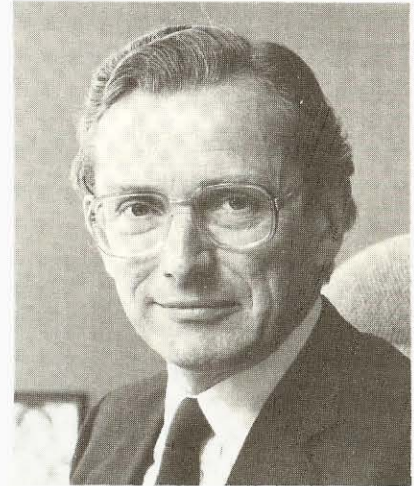
The Rt. Hon. Norman Fowler, M.P.,

New technology is vital to Britain's industrial survival. Our training matches that technology and makes a positive contribution to one of the key areas of industrial activity. Our initiatives help industry to understand that training is not a one-off event at the beginning of working life but is a continuous process.